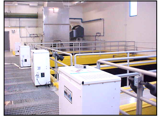
Photos: Interior shots of the new Devils Lake Water Treatment Plant.

"If there comes a little thaw, Still the air is chill and raw, Here and there a patch of snow, Dirtier than the ground below, Dribbles down a marshy flood; Ankle-deep you stick in mud, In the meadows while you sing, "This is Spring."