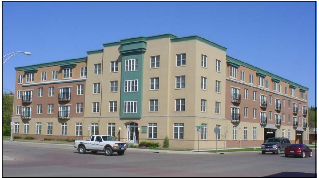
Bergstrom Electric projects in central North Dakota include the Library Square apartments in Mandan (above), the Best Buy store and Pet Smart (below).

Upcoming projects for 2008 include the University of Mary’s School of Business, Simile Middle School, and the McLean City Law Enforcement Center. ◇