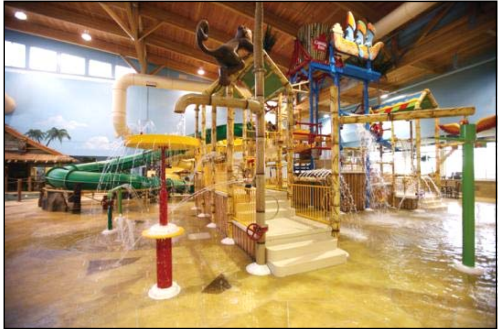
The Splashers of the South Seas Waterpark at the Canad Inn includes a variety of slides, swings, and water depths for all ages.

A Contractor Appreciation Day was held toward the end of the project and contractors were allowed to bring their families into the waterpark for a day. The