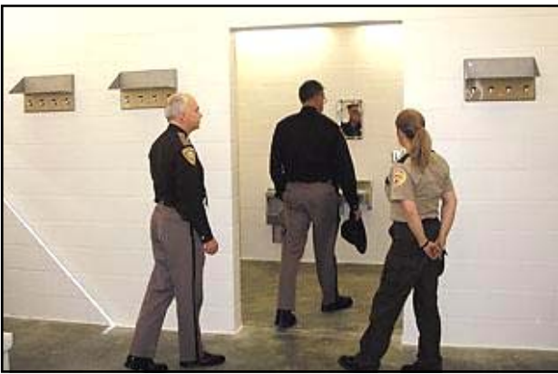
McLean County officials get a tour of the new facility during the Open House on March 17 of this year.

There were two electrical systems that Bergstrom installed in the building: a 1200 Amp 120/208V 3 phase system for the Main Distribution Panel and an 800 Amp 120/208 V 3 phase system for the Boiler. The project also included 23,200 feet of conduit, 102,500 feet of wire, 286 light fixtures, and 216 outlets. The total electrical construction contract was $655,000. ♦