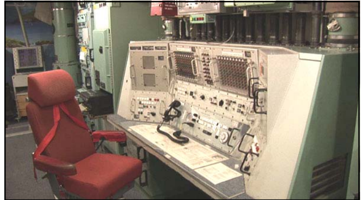
Photo Above: The Oscar Zero Missile Command Control Center - the front line of the Nuclear Cold War.

The Oscar Zero site is now owned by the North Dakota Historical Society, which offers daily tours of the facilities during the summer months, limited tours during the spring and fall, and by appointment during the winter months. For more information about the Ronald Reagan Minuteman Missile State Historic Site, visit the North Dakota Historical Society website at www.history.nd.gov/historicsites . ♦