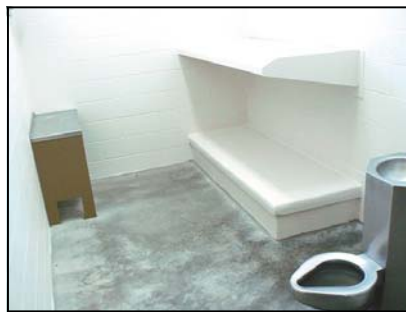
A standard cell in the new facility.

Fighting ceased in World War I when an armistice between the Allied nations and Germany went into effect on the eleventh hour of the eleventh day of the eleventh month.