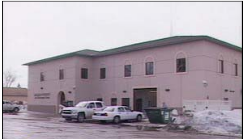
The new McLean County Law Enforcement Center in Washburn, ND was managed out of Bergstrom Electric's Bismarck office.

The $3.3 million project can house inmates in either small